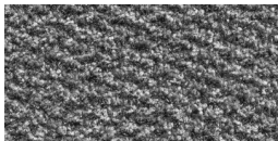
universal 014 grey